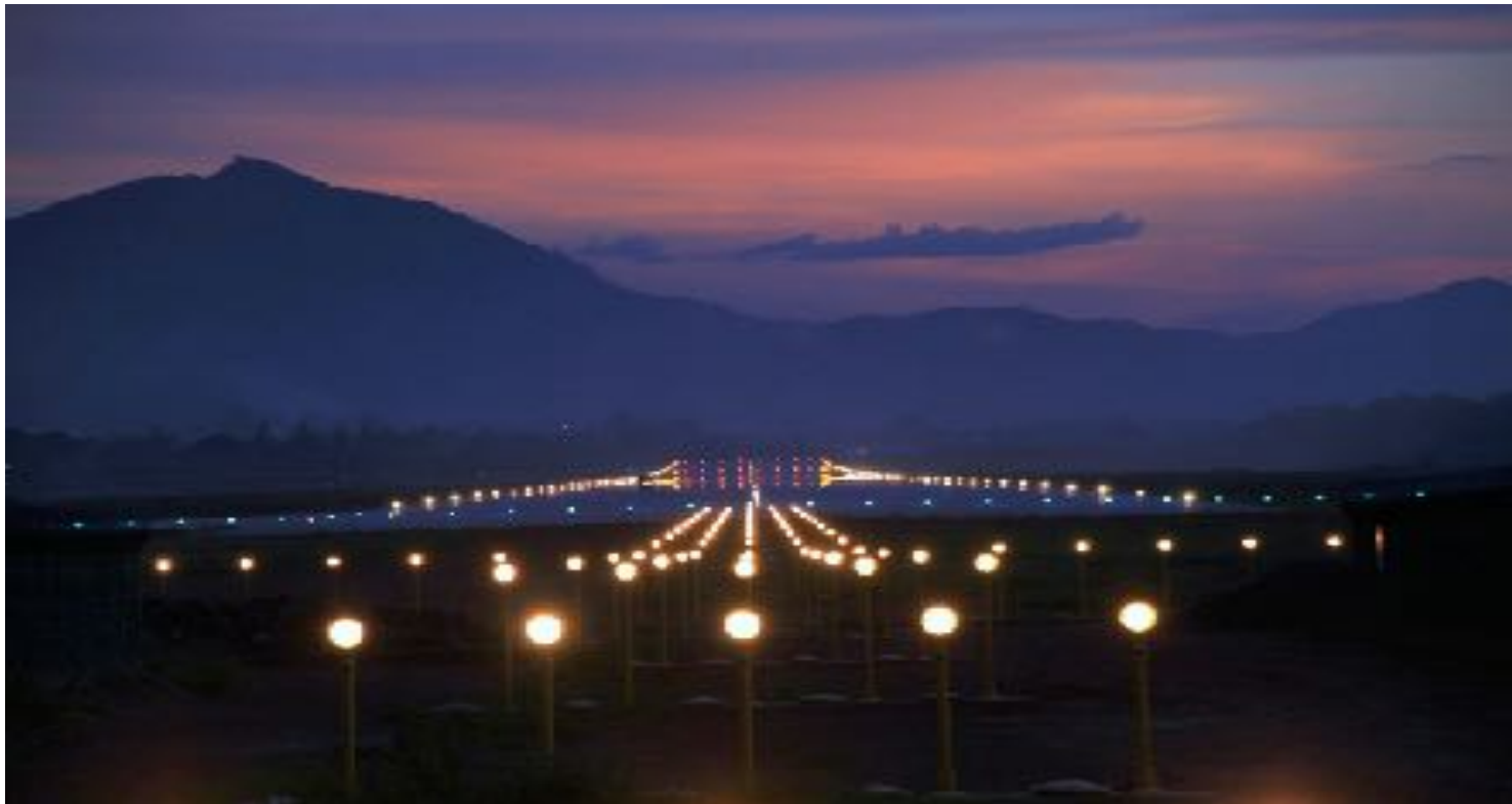
Night photo of completed runway

Work Scope: Construction of a 2900-meter runway, apron, terminal, approach road, car park, airport boundary, surround road and drainage system, as well as airport equipment procurement, installation and commissioning.