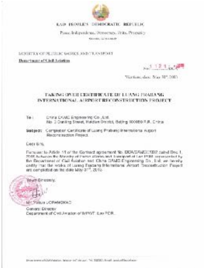
Final Acceptance Certificate