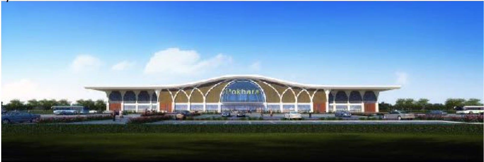
Conceptual Drawing of Terminal

Work Scope :This EPC turnkey project is to build an international airport complying with the international standards for ICAO Aerodrome Reference Code of “4D”, including Runway, Taxiway, Parallel Taxiway, Apron, Hangar, Terminal Building, Control Tower & Operation Building, Navigational Facilities, Meteorological Facilities, Aeronautical Lighting, Communications System, Surveillance Facilities, Roads, Lighting, Car Park Facilities, Rescue & Fire Fighting Facilities, Security Facilities, Power Supply Facilities, Water Supply Facilities, Drainage and Sewage System etc.