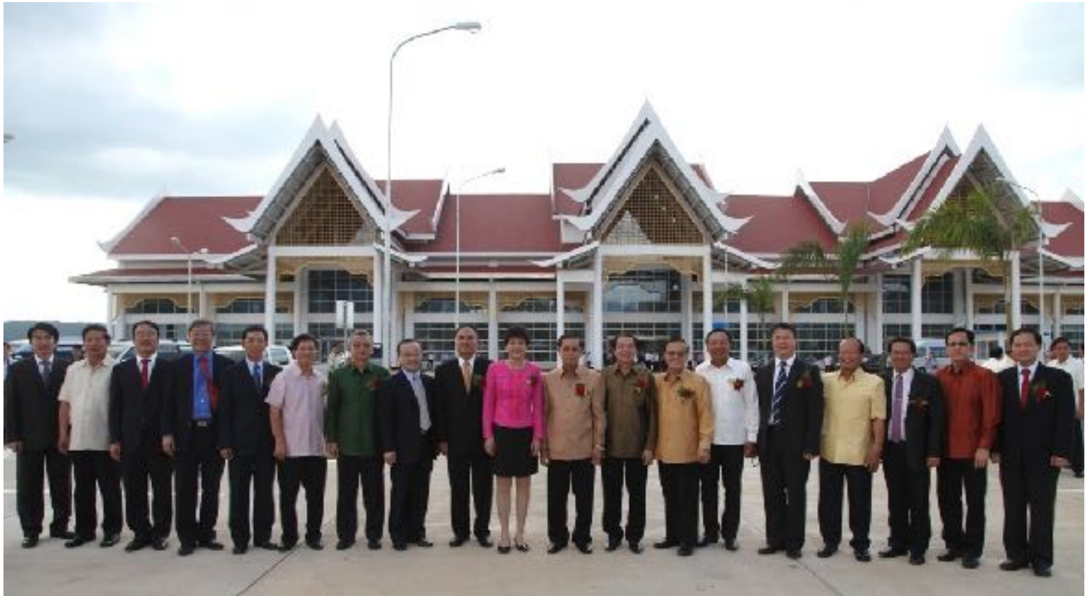
Somsavat Lengsavad ,the deputy prime minister of Laos is accompanied by Madam Luo Yan to visit project site