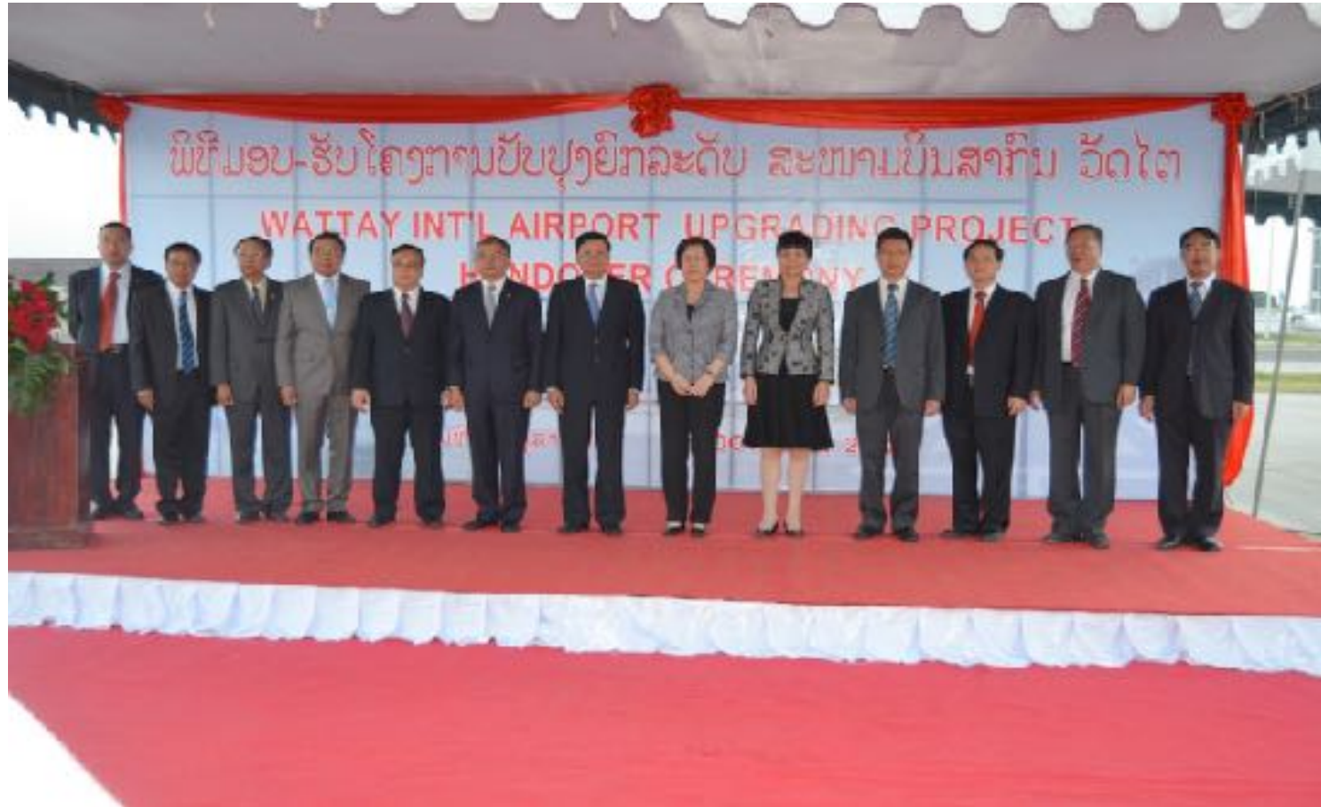
Hand Over Ceremony